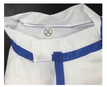
Visible Sizing Tag: Helps materials management teams identify size easily once suits removed from box.