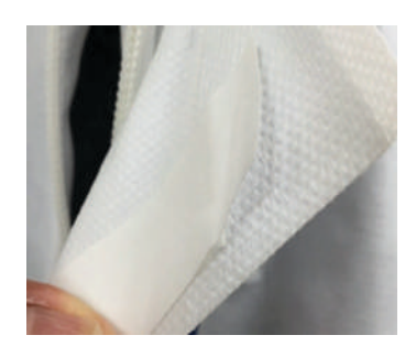
Zipper Front with Sealable Storm Flap has StarterTab for Tape: Easier for a gloved hand to pull and expose the tape for sealing storm flap.