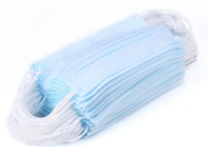
#2804 - Light Blue