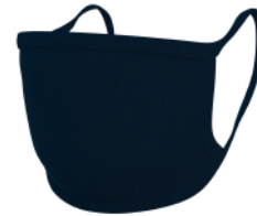
#2904N - Navy