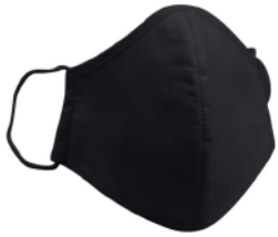
#2914B - Black