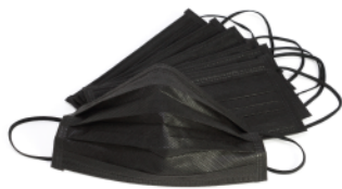
#2804B - Black