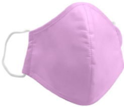
#2914P - Pink