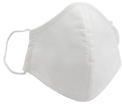
#2914W - White