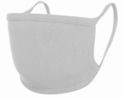
#2904W - White