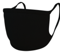
#2904B - Black