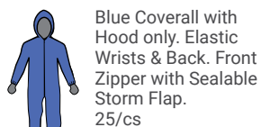
#2407 Medium - 4X

ViroGuard® 2 fabric and seams pass ASTM F1670 & F1671 for blood and blood-borne pathogens.