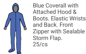
#2404 Medium - 4X